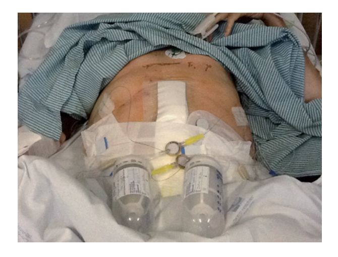
Figure 5 Elastomers bilaterally connected to TAP catheters.