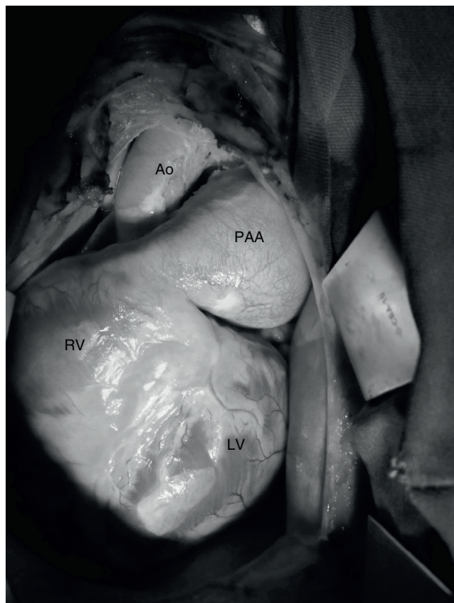
Figure 2 PAA aneurysm and increased RV; PAA, pulmonary artery trunk; RV, right ventricle; Ao, aorta; LV, left ventricle.

ventricle, significant dilation of the pulmonary artery trunk and its branches, and dysplasia with severe pulmonary valve insufficiency. Mean pulmonary artery pressure was estimated at 30 mmHg (normal reference value: 10–18 mmHg).