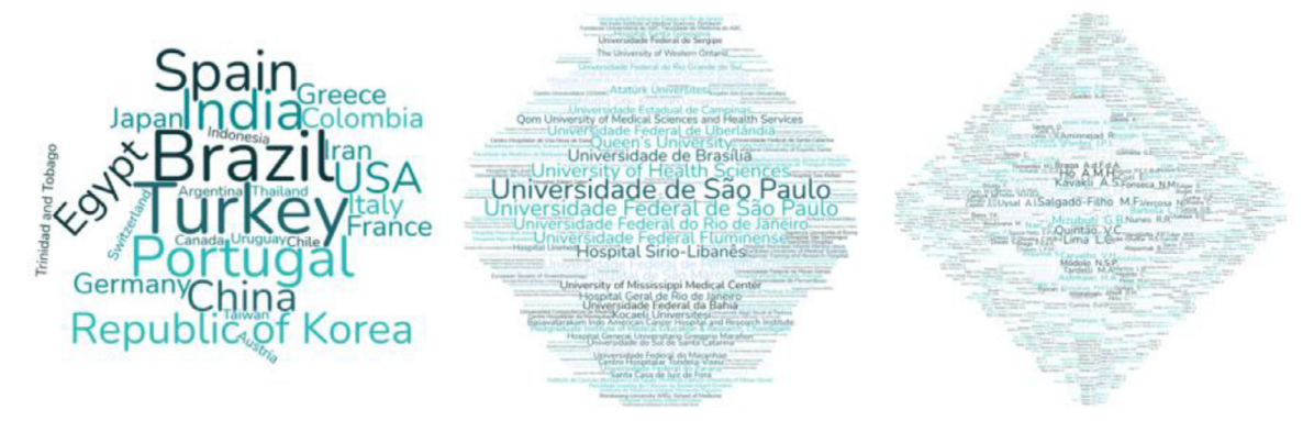
Figure 1 Visual representation of the frequency of origin by country, organization, and authors who submitted articles to BJAN between 2019 and 2021.

scientific production in Brazilian anesthesiology and creating a virtuous cycle toward excellence.