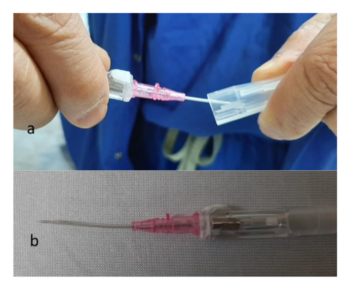
Figure 2 The IV needle-cannula shield (a) can be used to bend the set by a few degrees (b) while maintaining sterility.

Instead of parallel advancement, we suggest a slight upward tilt (Fig. 1c) to create an arrowhead-shaped tip that has the least chance of puncturing the upper/lower vein