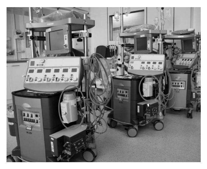
Figure 1 – Vaporizers Calibrated for Sevoflurane Attached to the Extracorporeal Circulation Circuit by the Manufacturer.

The membranes of the oxygenators available in Brazil used in the surgeries with ECC have the same basic raw material component when manufactured – the polypropylene. However, they differ in the oxygenator's external shape, and in the internal organization of the membrane, additionally to other components of the ECC equipment.