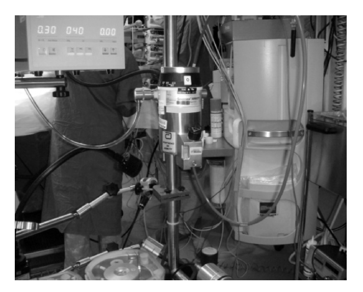
Figure 5 - Vaporizer Adapted to the ECC Circuit.