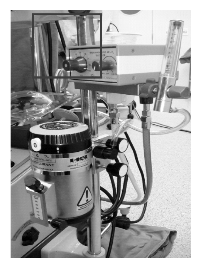
Figure 2 – Oxygen and Compressed Air Blender.

Other membranes qualified as diffusion and made of silicon are used in circuits to assist postoperative mechanical circulatory support, such as the ECMO ( extracorporeal membrane oxygenation ) <sup>35,36</sup>. Although these membranes have longer service life, they are not compatible with volatile anesthetics use, as described by Matthias <sup>34</sup>.