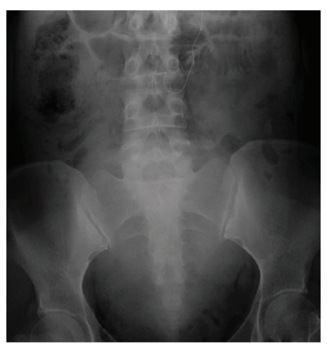
Figure 1 - The post-operative abdominal X-ray. The epidural catheter appears inserted at the L2-3 interspace.

Patients were placed in the right lateral decubitus position with flexed knees and hips. We used Portex CSEA needle (PX100, Smiths Medical®, USA) for single space segment technique. We have indwelt epidural catheter (EC-5500, Arrow®, USA) which is visible on X-ray for post-operative one-shot analgesia. Anesthesiologists usually used Jacoby's line (Tuffier's line) as landmark crossing the L4 spinous process. In our institution, an abdominal X-ray is taken routinely before every patient is discharged from the operating room for post-operative check-up. We included CSEA cases and compared the interspinous level that the anesthesiologist recorded and the actual epidural catheter insertion level confirmed by abdominal X-ray for each case (Figure 1).