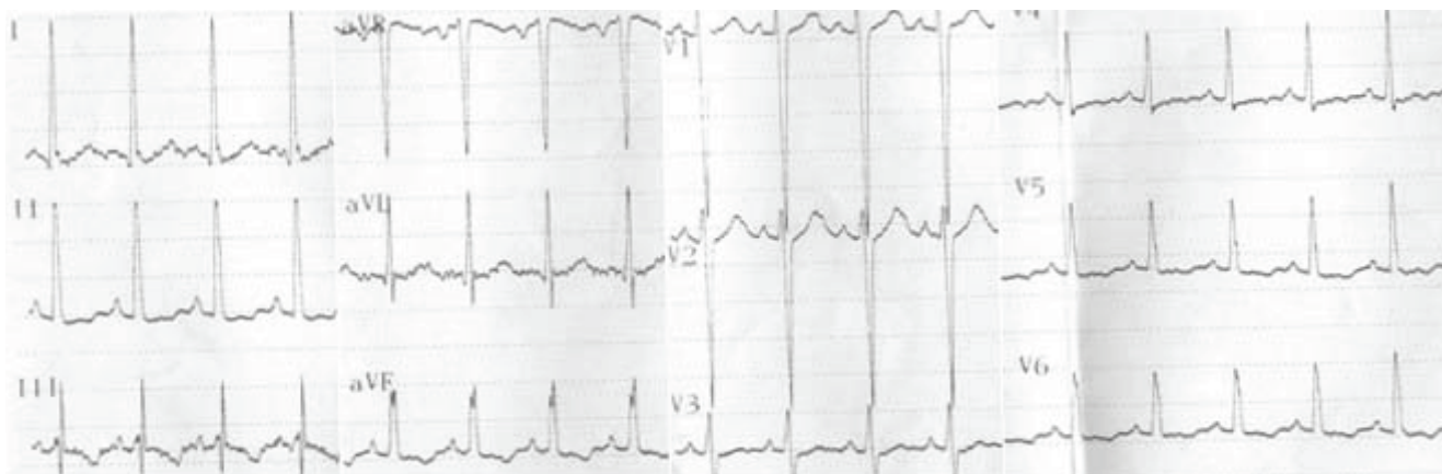
Figure 2 Patient's 12-lead electrocardiography at presentation.